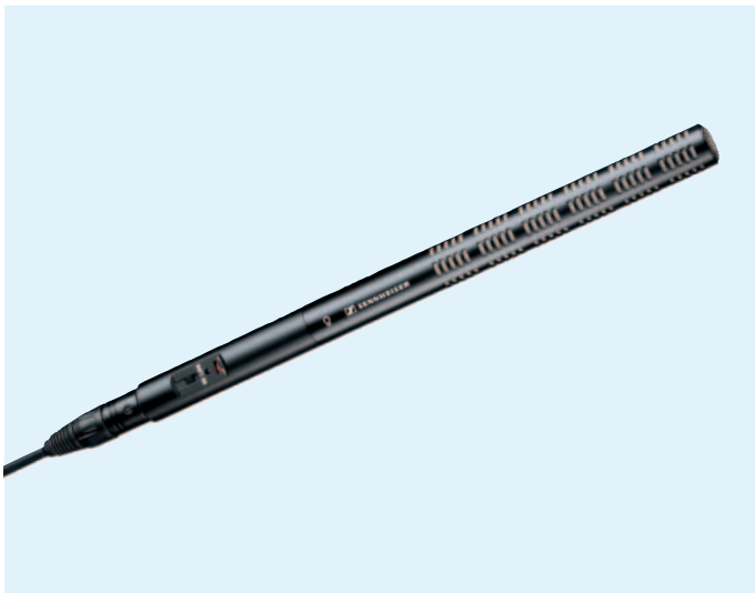
Pictured with K6 powering module and cable (available separately)

The ME 66 is a short gun microphone head designed for use with the K6 and K6P powering modules. It is especially suitable for reporting, film and broadcast location applications and for picking up quiet signals in noisy or acoustically live environments as it discriminates against sound not emanating from the main pick-up direction. Matt black, anodised, scratch-resistant finish.